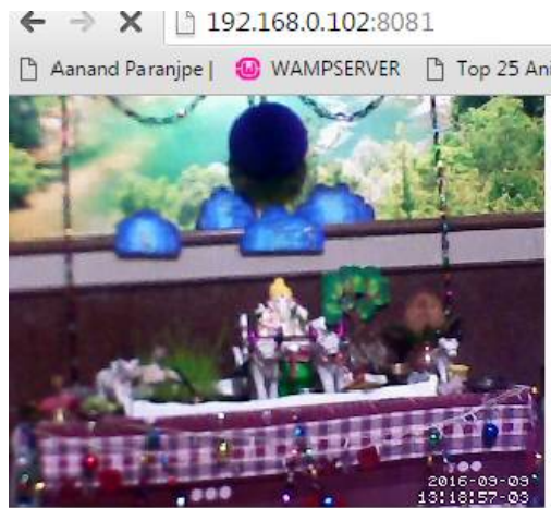
Fig 2. Real time video streaming

As shown in above fig 2, here for video streaming [13] camera is interfaced to beagle bone development board. The camera will capture the video only when the camera files are installed in the OS of beagle bone. The camera will capture the video than video will be processed and then the real time video can be viewed on mobile using IP address allotted for streaming.